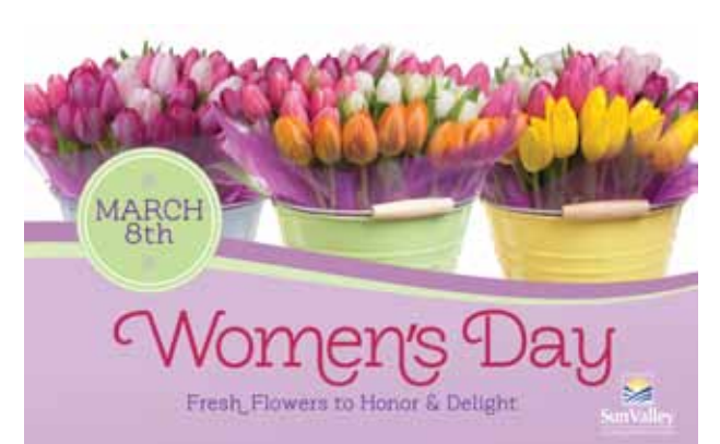
COOL TOOLS POP and marketing materials from Sun Valley and SAF helped industry members promote Women's Day.

FTD's Emily Bucholz said the "ranking of Women's Day was fairly low from a consumer interest [perspective] on FTD.com [in 2014], but we understand the importance in supporting smaller occasions and will continue to follow trends and understand the consumer's needs." The company plans to promote the holiday again next year. -M.W.