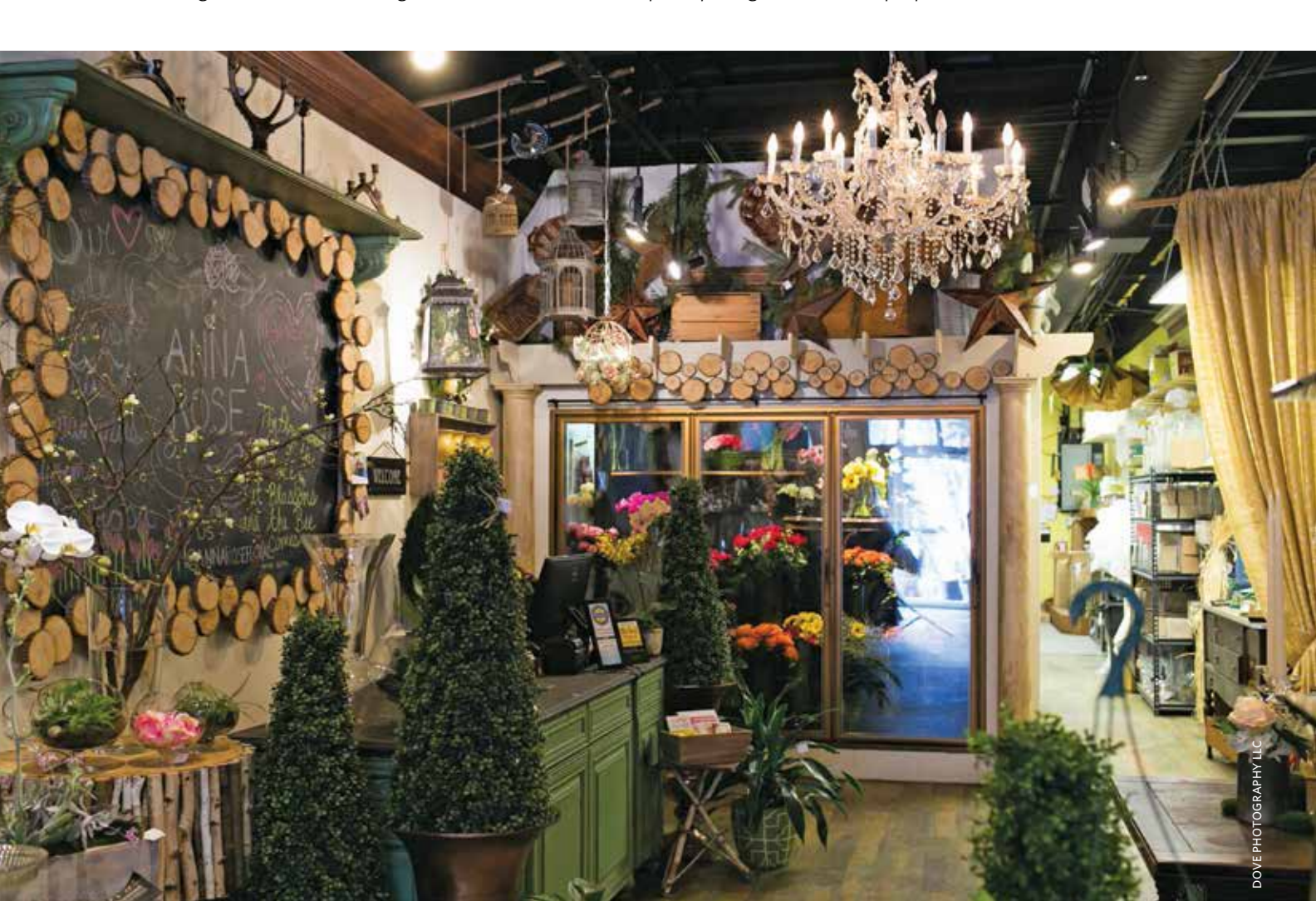
SUSTAINABLY COOL Alexa Maniaci actively markets her shop's environmental standards, including the use of LED lights and repurposed or reusable materials, such as wooden boxes for deliveries. That ethos was part of the shop's DNA: Her parents' business has installed four rooftop honeybee hives and a natural gas generator that produces energy from wasted heat.

Alexa also devoted space in the proposal to detailed info about some