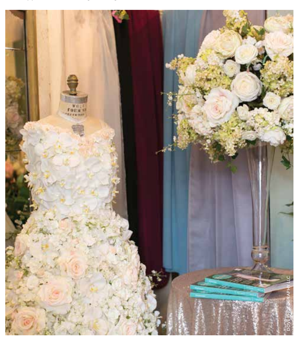
BLOOM AND GROW In four years, Anna Rose Floral has gone from about 70 weddings to 100 by year's end. The average wedding sale has increased from $3,500 to $5,000.

Rave reviews and good press surrounding the Super Bowl job helped put Anna Rose on the radar of other groups and people looking for event flowers. Just 18 months into her new gig, Alexa had lit the spark she needed to ignite the shop's launch into broader event work.