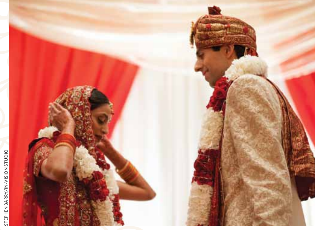
ADORNED Garlands play a major role in Indian weddings, decorating family members' necks, statuaries, tables and, often, the mandap. The grandest garlands, though, are worn by the bride and groom.